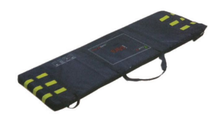
Oxford cloth and reflective tape: Applicable in small amount displays and