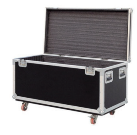
Flight case: Applicable For rentak display and long or short disrance delivery