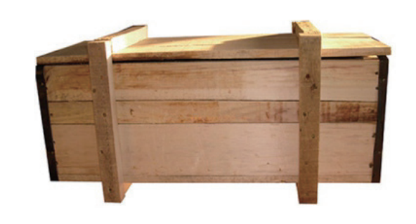
Wooden case: Applicable in fixed installation and long or short disrance delivery